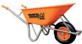
RHINO BARROW C/W PNEUMATIC TYRE HT04040