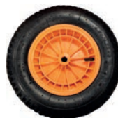
PNEUMATIC TYRE HT04042