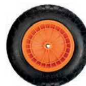
PUNCTURE PROOF TYRE HT04043