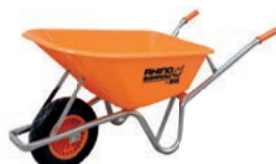
RHINO BARROW C/W PUNCTURE PROOF TYRE HT04041