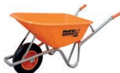
RHINO BARROW C/W PUNCTURE PROOF TYRE HT04041