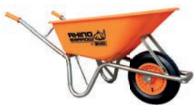
RHINO BARROW C/W PNEUMATIC TYRE HT04040